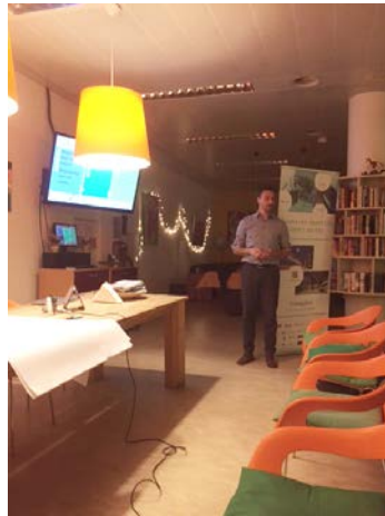
Figure 5: Impressions from the meeting in Eckart Vaartbroek

In Eckart Vaartbroek, one of the Triangulum demonstration areas in Eindhoven, an event was organised around “Samenspraak” (translates as “participation”). Residents of the neighbourhood were invited to come and have their say on how the project should develop around an innovative light route and on the most important points to be considered. This was done at an early stage of the project activities in Eckart Vaartbroek, ensuring the precondition of co-creation as much as possible. It integrated the resident’s right from the beginning by influencing the foreseen activities. This means citizens are not only involved in the implementation, but already in the in the planning phase.