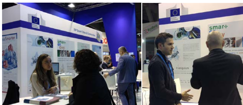
Figure 4: Impressions from joint EU SCC1 projects stand at Smart City Expo World Congress

Triangulum was presented as one of several projects within a joint EC SCC1 projects stand. The coordinator team as well as one representative from the city of Sabadell were present at the stand, sharing the experiences from the project and exchanging ideas with the other SCC1 initiatives and the public. The participating smart districts and the challenges for replication within the project were presented in various speaking sessions that have taken place at the stand.