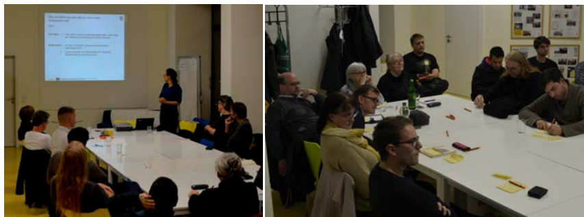
Figure 6: Impressions from workshop series in Leipzig

In September and October 2016, a series of four thematic evening events took place in Leipzig, aiming at bringing the Smart City topic closer to the inhabitants of Leipzig-West, the Triangulum focus district. Each workshop was dedicated to one Smart City related topic: Smart Energy, Smart Mobility, Smart District and Active Neighbourhood Society. After an input speech by a member of the local Triangulum team on Smart Cities and on first ideas on a “smart” district in Leipzig West, the participants got together in smaller groups. They discussed visions and obstacles for the further smart development of the district but also came up with their own project ideas. The results of the evenings will contribute to the Smart City implementation plan to be developed within the Triangulum project activities in Leipzig.