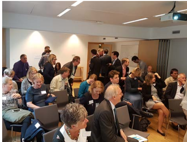
Figure 2: Impressions from the Triangulum workshop during Brussels Energy Week

During the Brussels Energy Week and in close cooperation with the ERRIN Network, the three Triangulum Lighthouse cities, coordinated by Eindhoven, organised an afternoon programme on smart city developments in June 2016. Triangulum was presented within workshops on specific challenges related to smart cities, focusing on citizen involvement, the perspective of a follower city and replication.