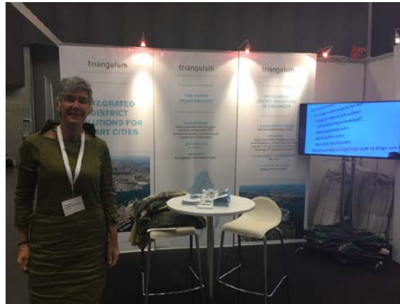
Figure 3: Impressions from Triangulum stand at Nordic Edge Expo 2016