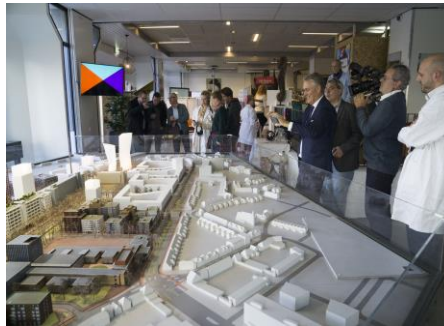
Figure 7: Triangulum Exhibition during the World Design Event in Eindhoven

A dedicated expo on the Triangulum activities took place in the frame of the event. The exhibition "Strijp-X" was organised in the Triangulum demonstration area Strijp-S. It showed people the activities that are being realised, with the help of Triangulum, in Eindhoven and especially in the Strijp-S area. There were showcases of some of the projects which were made possible by the iCity tender.