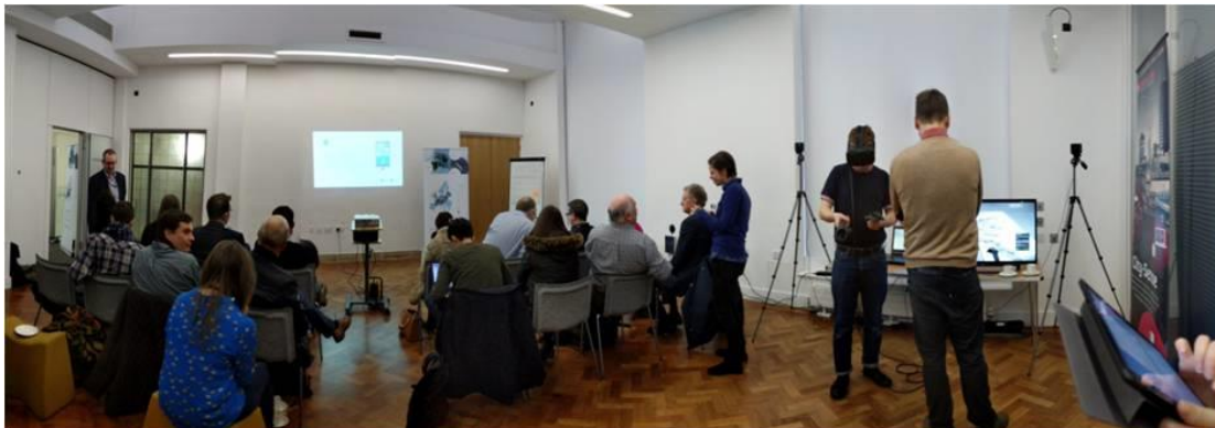
Figure 10: Impressions from the launch of the Manchester-I platform

There was a good turnout of data professionals from across the Manchester Triangulum partner organisations, as well as the City at the event. Attendees were invited to explore the system to understand the datasets available. Triangulum partner Clicks and Links also demonstrated the virtual reality possibilities they may be able to develop for the project. As well as learning more about the potential for virtual reality, attendees were able to put on the headset and enter virtual reality train tunnel.