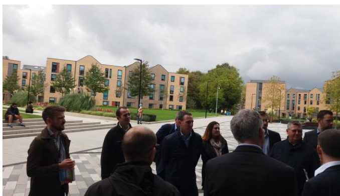
Figure 6: Delegates exploring the Triangulum initiatives being delivered at MMU's sustainable Birley Fields Campus, Manchester

Following a visit to Australia by key Manchester organisations, including the Triangulum project partners MCC, Siemens and MMU, key issues and projects for discussion were identified for the return visit. Between 9 and 13 October four representatives from the Australian City of Adelaide visited Manchester and Brussels as part of the project. Whilst in Manchester, Triangulum partners presented the project's progress on Distributed Energy Systems. This included a site visit to Manchester Metropolitan University's Birley campus which will host Solar Photovoltaic's and Electrical Energy Storage alongside energy saving interventions via a central controller provided by Siemens. The following day, presentations from Triangulum partners were made about incorporating Electric Vehicles into a corporate fleet, and also about the data visualisation work of Triangulum.