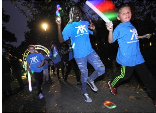
Figure 4: Opening of the Lighting Route in Eindhoven

Nordic Edge Expo is an international forum for knowledge exchange, inspiration and networking for all those who want to take part in possibilities connected to smart homes, smart cities and smart societies. The third edition of the event in 2017 brought together 4500 attendees from over 40 countries.