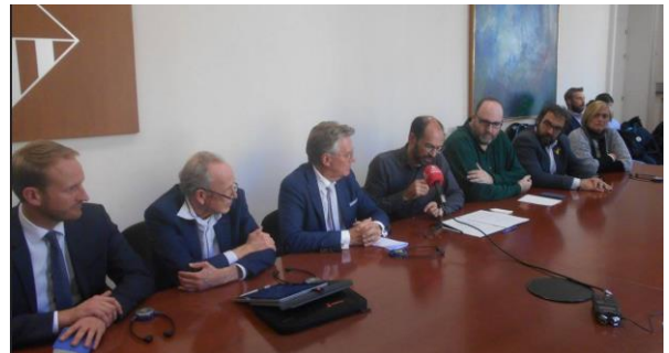
Figure 8: Impressions from the Mayors Meeting in Sabadell