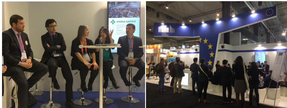
Figure 9: Impressions from joint EU SCC1 projects stand at Smart City Expo World Congress