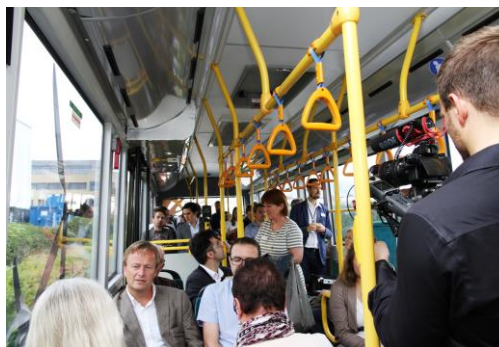
Figure 2: Impressions from the Tour de Triangulum in Stavanger

During the “Tour de Triangulum“, the guests received answers and information about the local project activities – and had a perfect opportunity to get familiar with some of the persons behind the solutions and the respective companies.