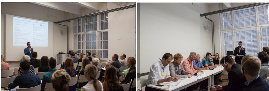
Figure 3: Impressions from the stakeholder workshop on Smart Home Care in Prague

The workshop took place in the framework Triangulum’s replication activities and as part of the Follower City training session organized by WP6. IPR Prague is collaborating with the University Center of Energy Efficient Buildings and the district Prague 7 on the project on smart home care. UCEEB is conducting research between senior citizens, carers and care providers in Prague 7 to identify their needs in terms of availability and provision of care.