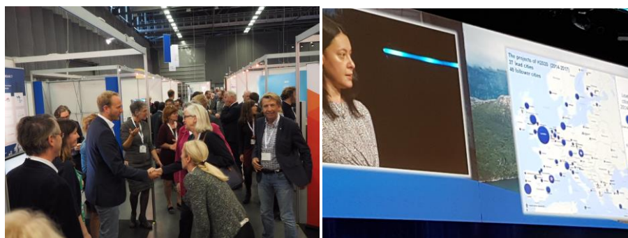
Figure 5: Impressions from Nordic Edge Expo 2017

The event was co-organised by the Triangulum partner Stavanger Municipality. During all three days, a joint booth of Triangulum together with the other eight European funded Smart City Lighthouse projects took place at the Nordic Edge exhibition area. Partners of the Triangulum consortium and of the other Lighthouse projects informed the visitors on their projects and the latest developments. Furthermore, the workshop “Leading the Way to a Smart Future – Meet the New Lighthouse Cities”, co-organised by Greater Stavanger and the Stavanger Region European Office on 27 th September, offered the Lighthouse Cities of the two new projects mySMARTLife and RUGGEDISED the possibility to present themselves. On the evening of 26 th September, Triangulum organised an informal get together for all attending Horizon 2020 Lighthouse project members. A short presentation of the different projects was given by the project leaders, followed networking possibilities, where the participants were able to talk more in depth about mutual experiences within their projects.