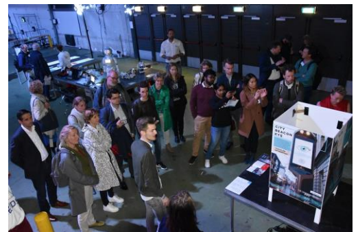
Smart Cities Event

The event was organised by TU/e Smart Cities program, Brainport Smart District, Triangulum, City of Eindhoven, Dutch Technology Week.