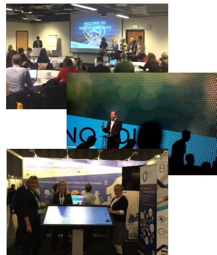
Impressions from Nordic Edge 2018

On Tuesday, 24.09., we are merging into the official Nordic Edge by co-organising the session " On a Mission for the European Cities of the Future – Achievements, Challenges, Opportunities " together with Nordic Edge, the European Commission, EIP-SCC, SCIS & Stavanger Region European Office.