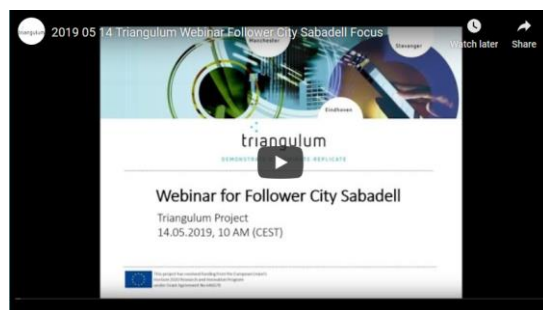
Triangulum Webinar on YouTube

Amongst other topics, Sabadell asked to learn more about green mobility, especially with respect to schools. So we got Mark Cox from the City of Eindhoven to talk about this topic and to talk about how biking is done in the Netherlands (Spoiler: it's different! Children seem to learn how to ride a bike before they learn how to walk...).