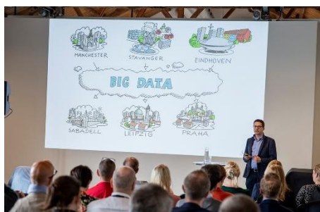
Triangulum Event in Stavanger

The Stavanger partners presented their demonstrations and the positive effects Triangulum has caused in their organisations. For example, Triangulum tremendously helped the municipality in turning Stavanger into a Smart City and to take more environmentally friendly decisions.