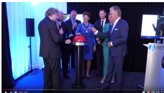
ITS European Congress

ITS was organised by ERTICO that also produced a video with highlights of the event.