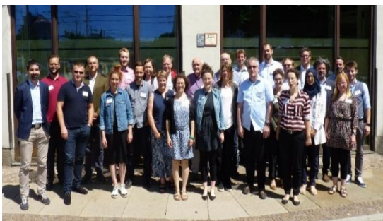
EfficienCE Consortium

During the meeting, the project partners from Vienna (A), Gdynia (PL), Maribor (SI), Bergamo (IT), Plzen (CZ) and Budapest (HU) discussed their different project approaches.