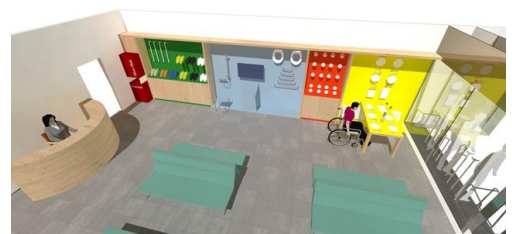
Future Showroom of Prague 7

The city district Prague 7 will soon open a showroom with medical and compensatory aids for its citizens. The project has been inspired by the European Smart City project Triangulum, when representatives of Prague 7 and IPR Prague visited the Lighthouse City Stavanger in 2018 to learn about their Smart Home Care approach. During the stay in Stavanger, the delegation also visited the showroom at the innovative social and health care department. For the realization of a similar offer in Prague, the waiting room of the Polyclinic of Prague 7 will be transformed. Currently, the Social and Health Department of the Prague 7 district is preparing the room to present various devices that can make life easier for both sick people and their peers and care takers. The aim is to inform elderly people and their peers how they can stay at home longer on their own, which devices can support them to do so and to receive an overview of all available social and health services.