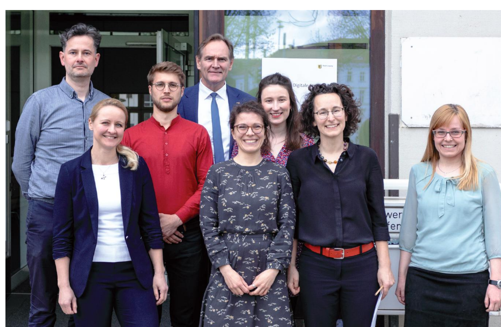
Team of the new Digital City Unit together with Burkhard Jung, Mayor of Leipzig.