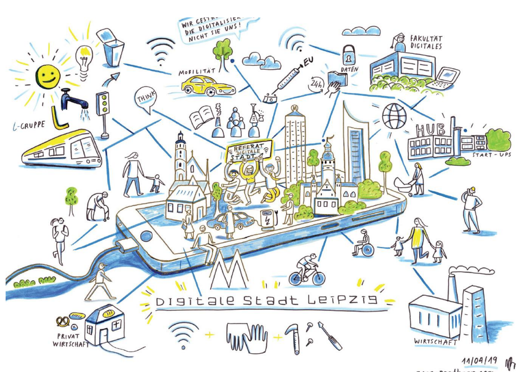
Digital City Leipzig