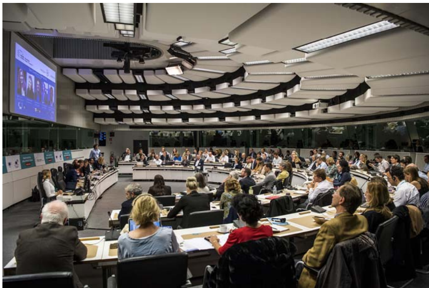
Figure 6. "From Dream to Reality"