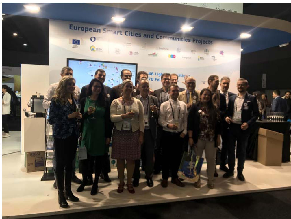
Figure 11: SCC1 BoC in front of multi touch tool at SCEWC 2019