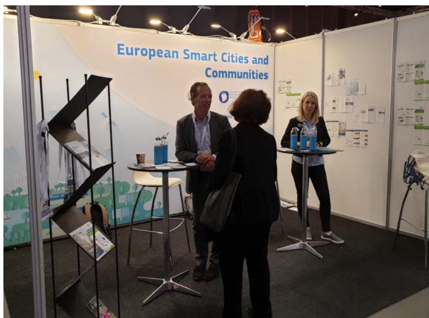
Figure 5. SCIS & EIP-SCC joint stand at Nordic Edge 2019

Additionally, Triangulum was represented with flyers, brochures and personal interactions at the SCIS & EIP-SCC joint stand during all three days of the exhibition.