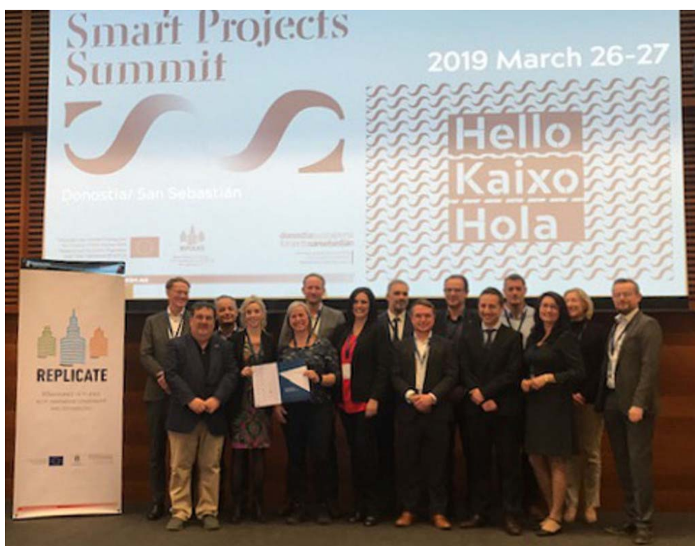
Figure 3. BoC signing the new manifesto

The two-day event was rounded off with internal working group meetings at Talent House, with a splendid view over sunny San Sebastián. There, the different working groups, such as the Board of Coordinators, the Replication or the Communication Group, met to discuss joint topics and to work on joint activities.