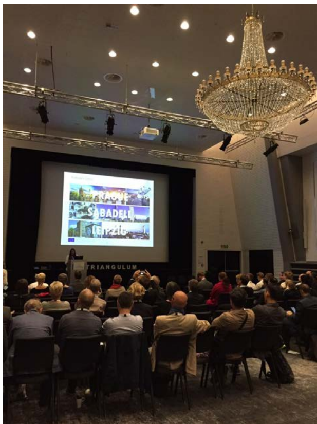
Figure 5. Triangulum Conference at Atlantic Hall Stavanger