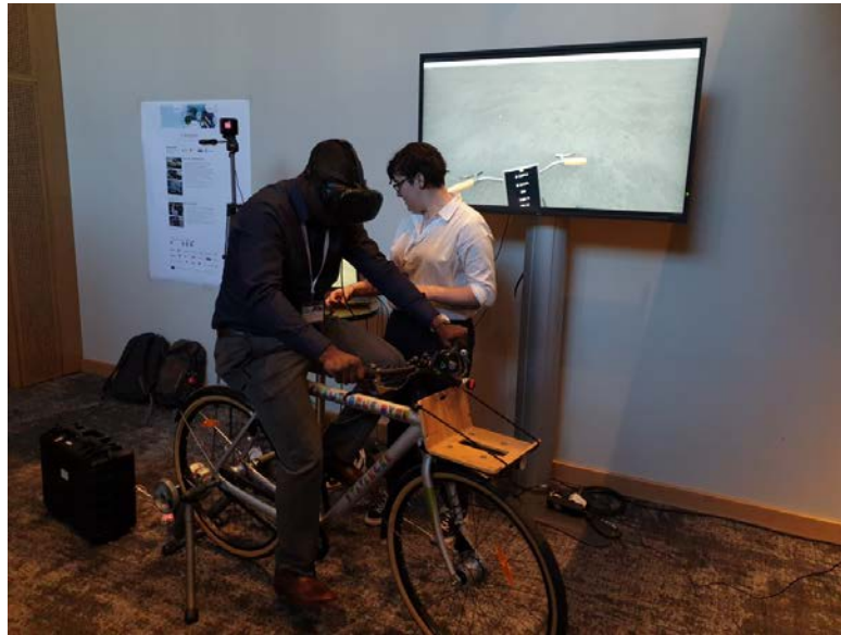
Figure 7. International Conference Participant testing PixelMill's Virtual Reality Bike

From 24-26 September 2019, the fifth Nordic Edge Expo & Conference took place in Triangulum's Lighthouse City Stavanger, Norway. The Nordic Edge Expo is the one number one place in the Nordics for the Smart City community to exchange knowledge, network and create new business opportunities. This annual event is thus the ideal meeting place for the Triangulum partners but also for the project partners of the entire Horizon 2020 Smart Cities and Communities programme. 4500 visitors from all across Europe and beyond attended the 2019 edition of this three-day event.