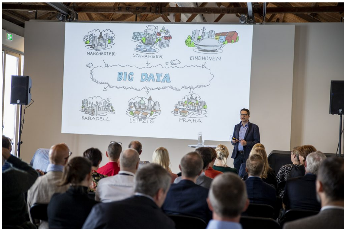
Figure 4. Local Stavanger Event

The event was organised and held by the local Stavanger partners of Triangulum. The following partners were represented: City of Stavanger, Greater Stavanger, University of Stavanger, Rogaland County Council, LYSE.