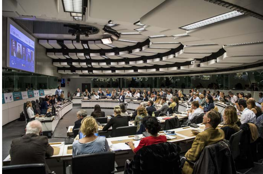
Figure 9. “From Dream to Reality”